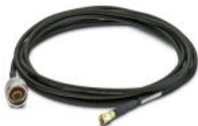
The figure shows a version of the product

Antenna cable, outside diameter: 5 mm (0.2 in.), inner conductor: solid, attenuation: 0.9 / 1.3 / 2.0 dB at 0.9 / 2.4 / 5.8 GHz, connection: N (male) -> RSMA (male), cable length: 2 m (6.5 ft.)