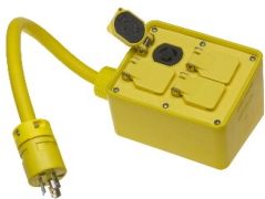
Angled Outlet / GFCI Outlet Box Series 130135