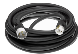
50A Power Cord Series 130143