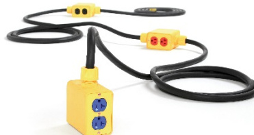
3-Phase Stringer Set Series 130137